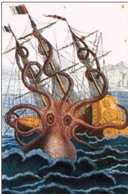
The kraken, a colossal octopus, in an 1801 Century drawing by Pierre Dénys de Montfort, based on descriptions by French sailors.

would still need a horny jaw, and assuming that it was not destroyed by bacteria, might it still be possible to find a fossil of its beak? Third, why did the bones near the critical Specimen-U bi-serial vertebral array remain undisturbed, and could the arrangement possibly be due to compaction?