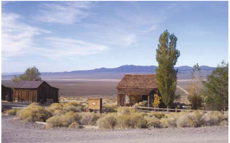
The Berlin-Ichthyosaur State Park in Nevada is also home to a 19th Century ghost town and an abandoned mine.

$30 plus $2.50 for shipping and handling