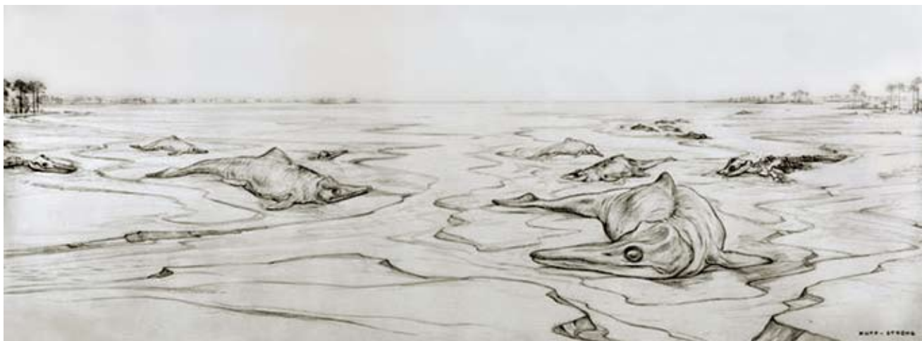
Drawing of ichthyosaurs by William Huff, depicting Charles Camp's 1980 hypothesis that they were stranded at the site in low tide. A later study showed, however, that this was a deep water site, invalidating the Camp hypothesis.

Giant Cretaceous squids (such as Tusoteuthis ), reaching lengths of up to 11 meters, are assigned to the vampire squids because of similarities in the shape of their pen (gladius) to that of Vampyroteuthis . Thus, somewhat reduced oxygen levels would not necessarily have posed a significant challenge for the hypothesized Triassic Kraken, although we do not know exactly what