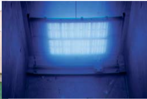
KAERI's gamma irradiator and (inset) the cobalt source.