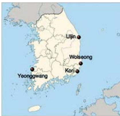
Nuclear plants in South Korea (view) ● Active plants

Korea ranks sixth in the world for nuclear energy, with 35 percent of the nation's electricity coming from nuclear. Shown are Korea's nuclear plant sites.