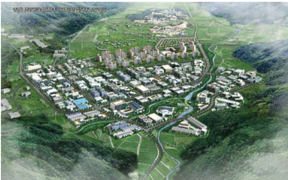
Illustration of the industrial science complex for radiation-based technologies, being constructed near the Advanced Radiation Technology Institute.

In the countryside, agriculture is the most important industry. Do you know how difficult it is to gain any economic benefit by growing rice, corn, or vegetables? So this is the area where we were located five years ago. This institute was created five years ago, after the previous five years had been used to make special laws as well as the planning; finally this institute was founded and opened in 2006.