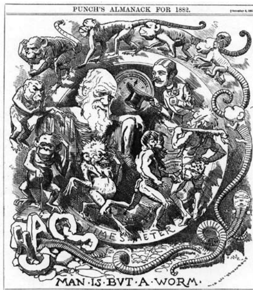
Darwin’s theory of evolution was caricatured in Punch in 1882, under the title “Man Is But a Worm.”

Dogs have been with mankind since before recorded history, so the genesis of