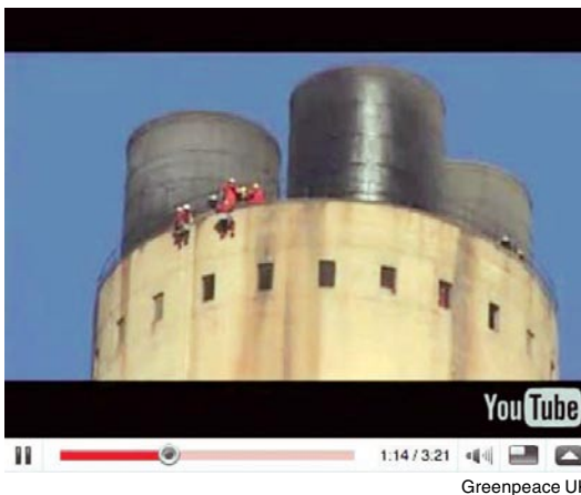
Hansen and Gore made me do it?

The question remains about the fallout of the verdict. At present there is some