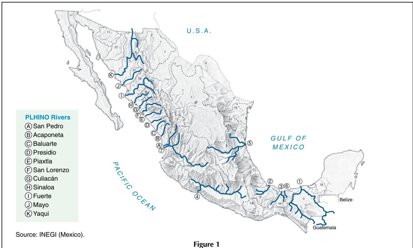
Figure 1 MEXICO'S MAJOR RIVERS