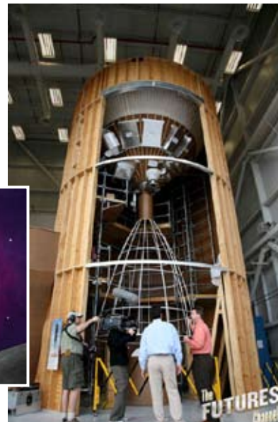
The Futures Channel

Engineers in front of a model of the Ares launch vehicle. Inset: Artist’s drawing of a launch vehicle in flight.