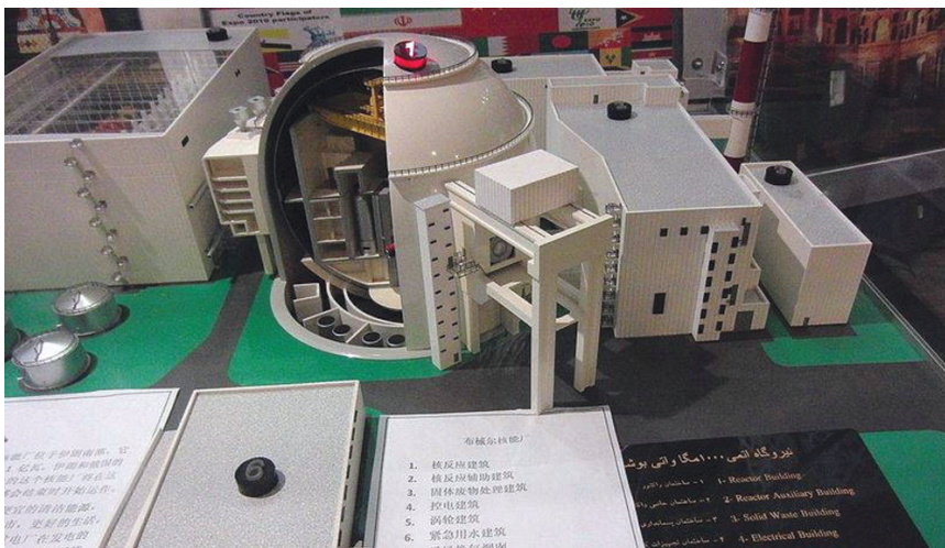
A model of the Bushehr Nuclear Power Plant, exhibited in the Iranian pavilion of EXPO 2010 in Shanghai. The map shows the location of Bushehr.

Iran made a commitment to full use of nuclear power in 1970. The German firm Kraftwerk Union AG signed an agreement to build two nuclear plants at Bushehr in 1975, and withdrew in 1979, when both plants were partly completed. Reportedly, Germany was pressured by the United States to withdraw. During the Iran-Iraq war, 1984-1988, the Iraqis damaged the plant site in air strikes. Bushehr I was completed with Russian assistance in September 2011.