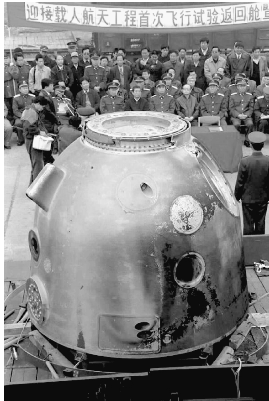
The Chinese spacecraft Shenzhou after its return from an unmanned test in November 1999.

Ten years ago, during a trip to China, former Senator and astronaut John Glenn stated in Beijing that if the United States did not invite China to participate in the then-evolving International Space Station, China would build its own. Aside from what is necessarily gained in any collaboration on challenging science and engineering endeavors, refusing to cooperate in space as a way of "punishing" China for policies that do not meet U.S. approval, has only led China to develop its own indigenous technology, industry, and technical manpower.